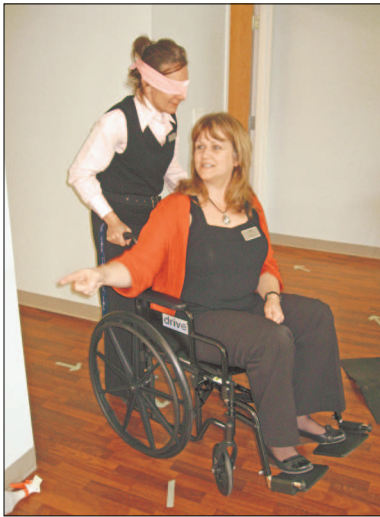
Staff from Marquise and the Harrison office take the great wheelchair challenge.

The Harrison started the accreditation process with a kick-off party on April 30 for residents and staff. Six "hands on" stations were set up to put everyone's practical skills to the test, such as being able to identify hazards and trying to pass the handwashing technique test.