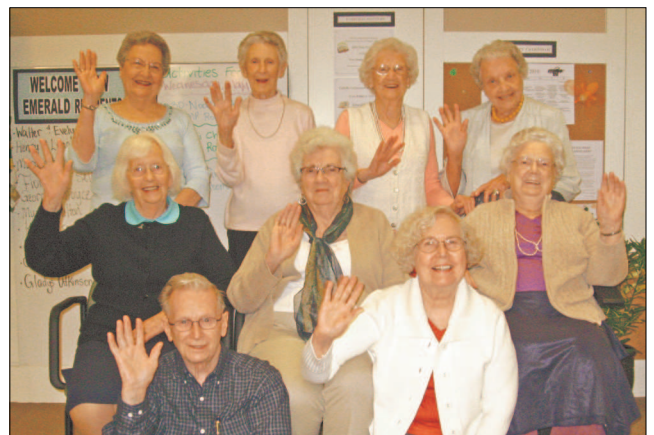
Only one guy is going on the bus trip...and he wouldn't mind a little male company!